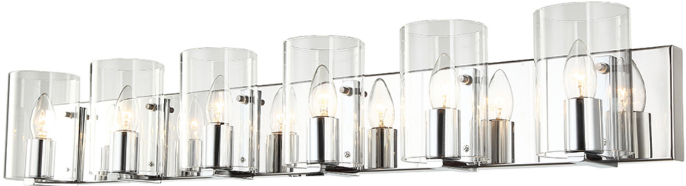
Image May Not Reflect Fixture Finish